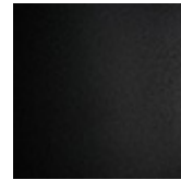
GFM73 гофрированная сталь, окрашенная в черный