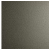
GFM11 гофрированная сталь, окрашенная в титан