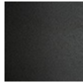
GFM69 гофрированная сталь, окрашенная в графит