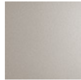
GFM70 гофрированная сталь, окрашенная в жемчуг