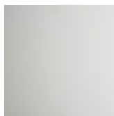
OP71 белый матовый