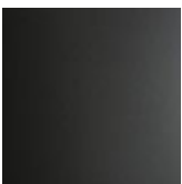
OP69 графит матовый