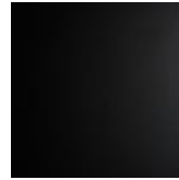
OP17 черный матовый