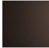
GFM18 гофрированная сталь, окрашенная в бронзу