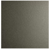
GFM11 гофрированная сталь, окрашенная в титан