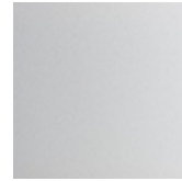
GF71 белый матовый лак с тиснением